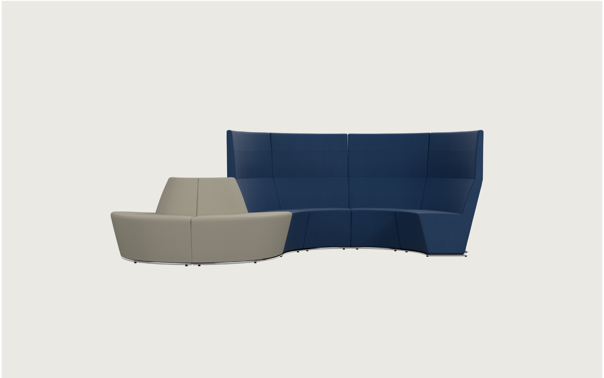
AREA RADIUS Modular seating Design: Anya Sebton, 2016