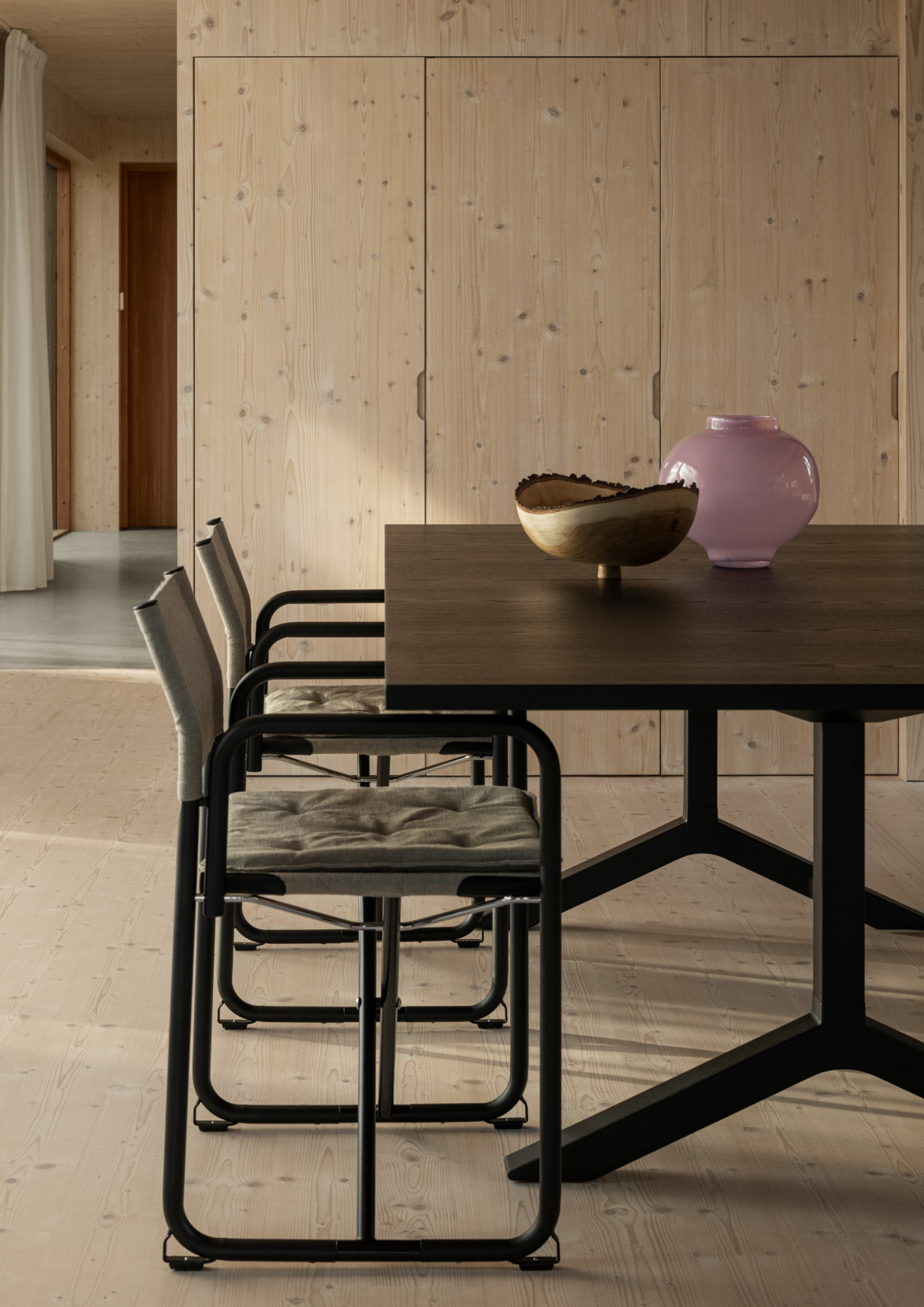
TABLE 45 CM