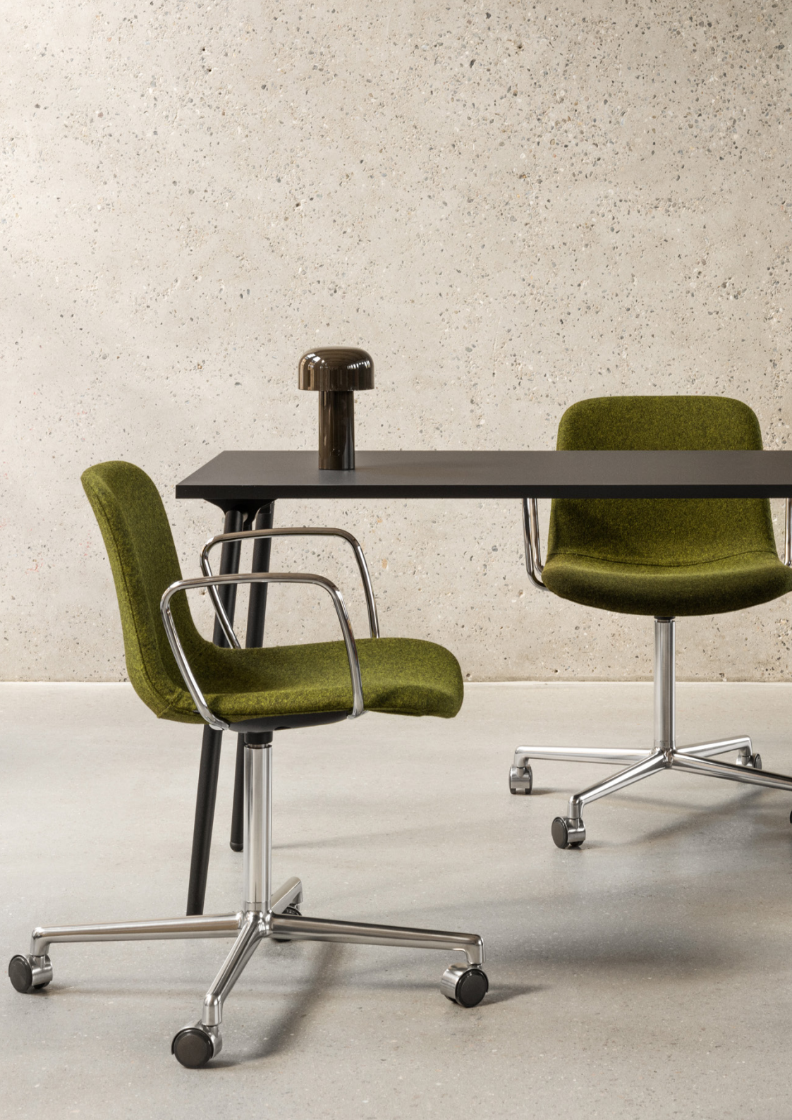
TABLE WITH STANDARD LEG