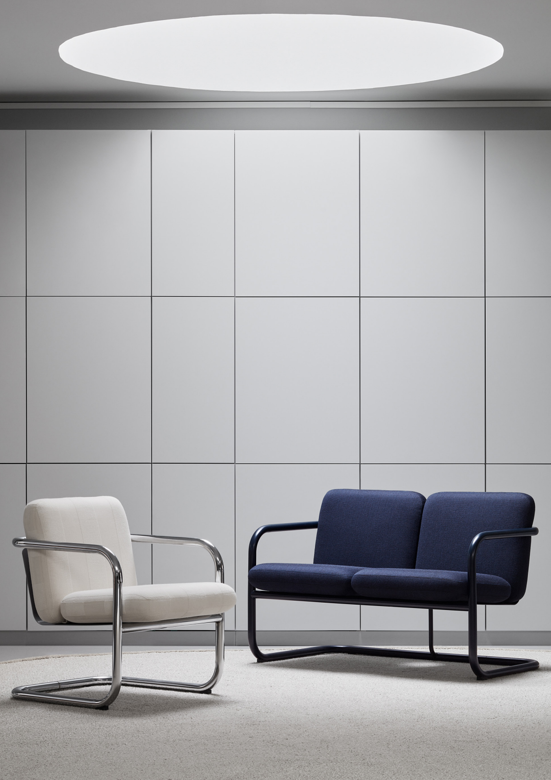
S70-4 EASY CHAIR