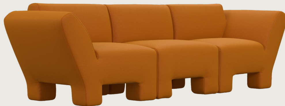
GEOFANTI Modular seating Design: Anya Sebton, 2024